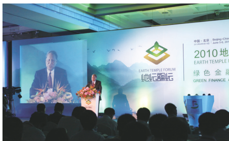
▲ 第九、十届全国人大常委会副委员长成思危先生在“地坛论坛”发表主旨演讲

Information Products: For all kinds of carbon market stakeholder, CBEEEX launched an electronic magazine Carbon Market, and CarbonInfo, daily newsletter SMS service.